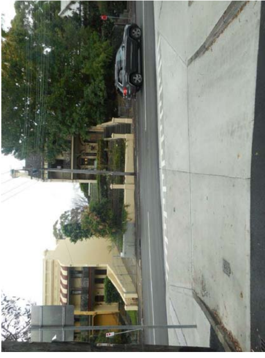
Example of a Continuous Footpath Treatment